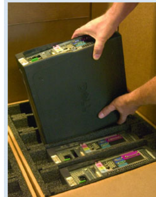
These photos illustrate the packaging reduction when an equivalent number of computers from individual boxes are loaded into a 20-container version of the Eco-Delivery crate.

http://www1.us.dell.com/content/topics/global.aspx/corp/environment/en/prod_design?c=us&l=en&s=corp&tid=005